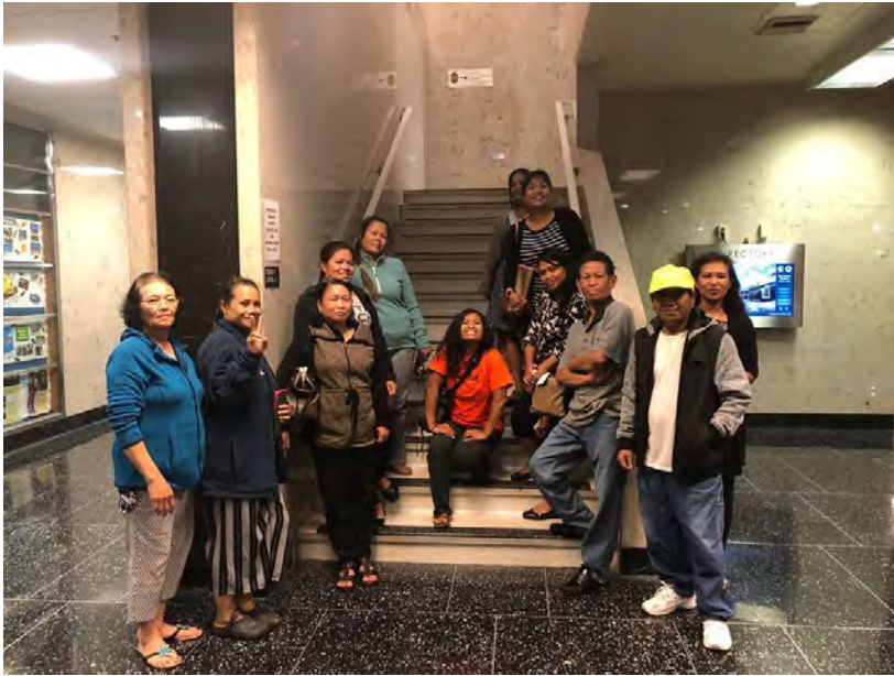
Freedom Inc. Clients attend Madison City Council Hearing to testify for more funding for mental health services for Southeast Asian elders.

FREEDOM INC. " O U R C O M M U N I T Y I S O U R C A M P A I G N "