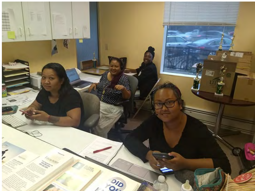
Community Power Building Staff at a Phone Banking Session to reach voters about School Board Election