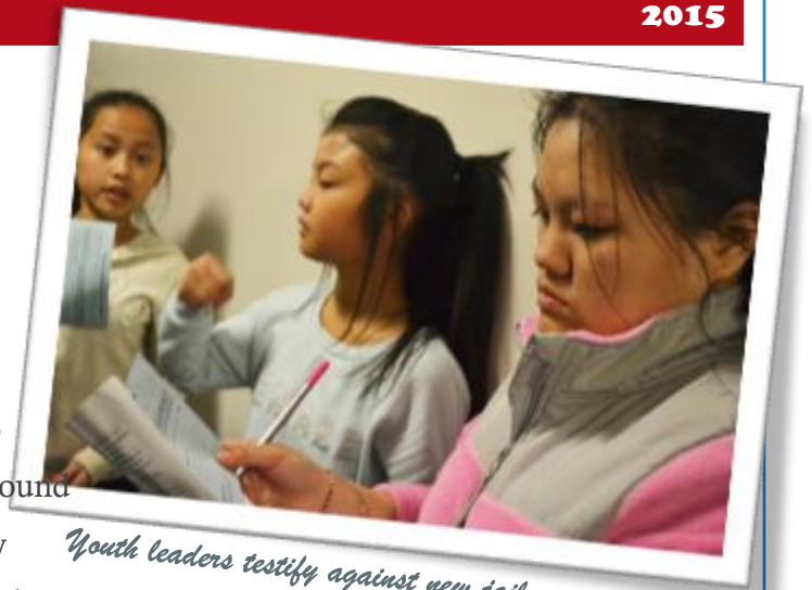
Youth leaders testify against new jail

This means we heavily invest resources and energy into people to be empowered in transforming the systems around them. We believe that the change our world so critically