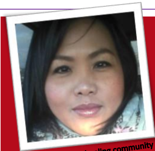
Ending violence, healing community