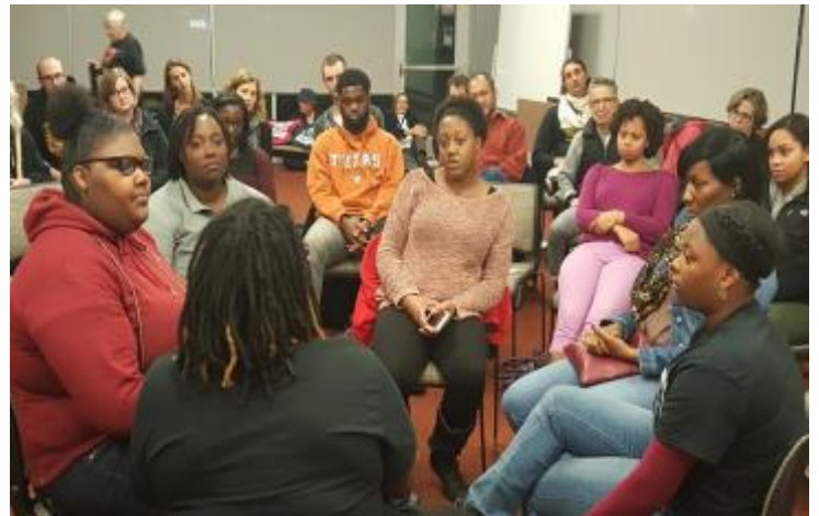
Black women, youth and queer and trans survivors of violence teach about race and gender based violence