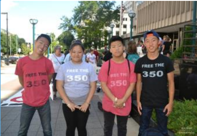
Southeast Asian youth, as part of Asians for Black Lives, stand in solidarity with ending mass incarceration